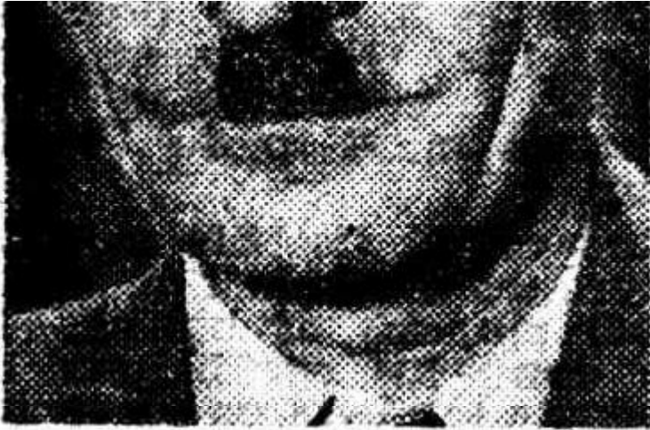
Prof. H. S. W. Massey.